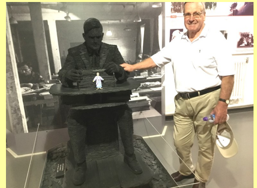
Bletchley Park and Alan Turing