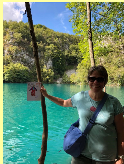
Plitvice National Park