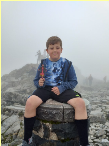
Top of Ben Nevis