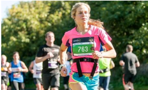
Scottish Half and 10K 2020 20 September 2020

However if you are after a challenge and an adrenaline rush, or know someone who is, then why not sample one of our organised events? Take a look at what's on offer.