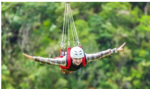
Zip Wire Challenge Aviemore 2020 2 May 2020