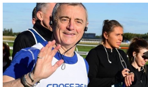
Edinburgh Marathon Festival 2020 23 and 24 May 2020

Anyone interested can find more information at www.crossreach.co.uk/events