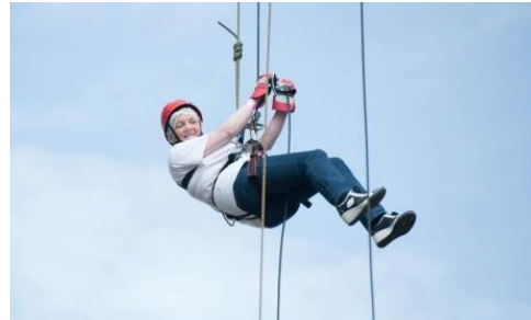
Forth Rail Bridge Abseil 2020 10 May 2020